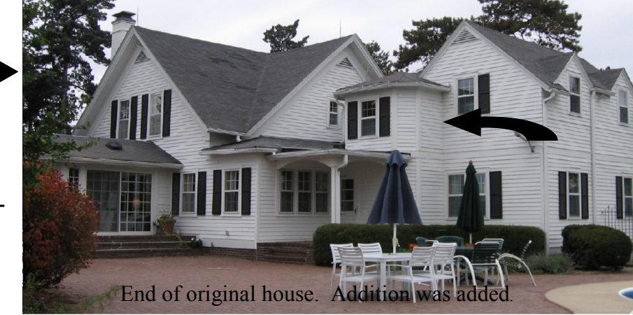
Original open covered drive through (entrance) was enclosed to make a sunroom

North of this house was an orchard with a large elm called the "Meeting Elm". Many Scottish