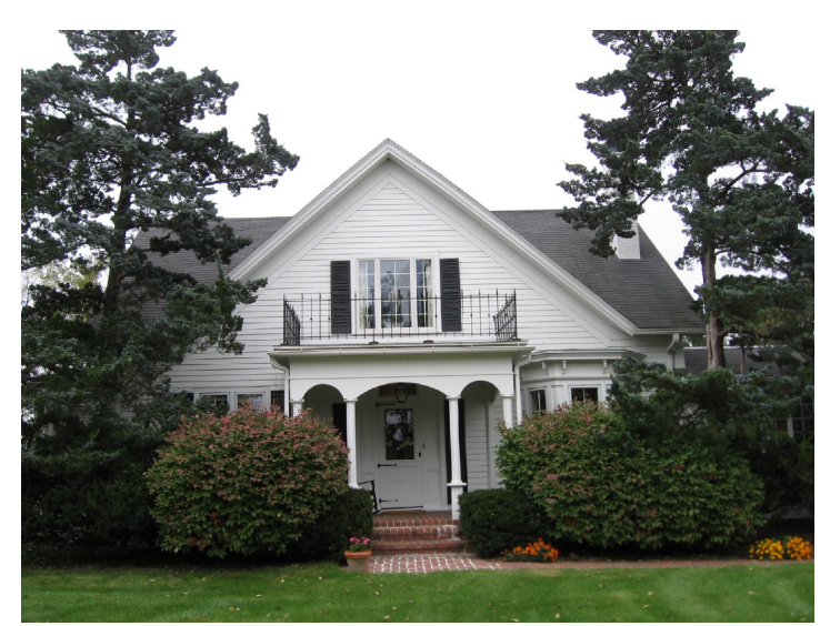
Scotch Ridge Road 150 year old house built for Wm Buxton