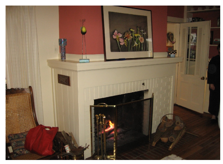
Original fireplace, still in use