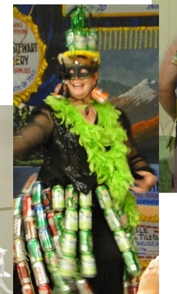
THANK YOU! THANK YOU! THANK YOU!