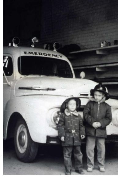
Indianola's 1st Emergency Vehicle 1956