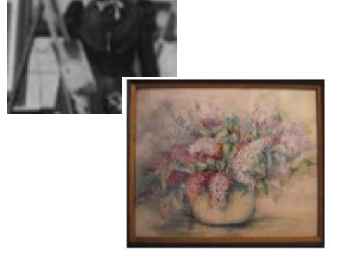
Floral water color done by Etta Budd in 1901, courtesy of Farm House Museum