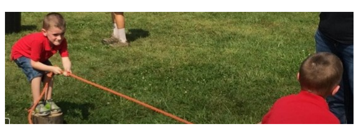
Twins Tug of War