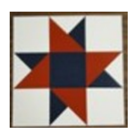
THE RAFFLE 2 Barn Boards plus Quilt (85" X 85") by Debbie Simpso Raffle tickets are 1 for $1 or 6 for $5