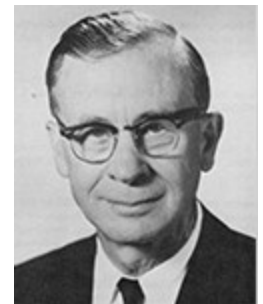
Lymon Craig