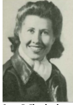
Irma C. Cleveland Weigel Born Dec. 25, 1915 in Artesian, SD and died March 12, 2004, Santa Clara, CA

Irma Cleveland and Dorothea Norris were members of the Womens Airforce Service Pilots (WASP). Of the 25,000 women pilots that applied for the WASP program, only 1,074 earned their wings and ferried planes to bases across the country. These women flew essential non-combat missions so that all of their male counterparts could be deployed in combat situations. WASP were required to complete the same primary, basic, and advanced training courses as male Army Air Corps pilots, and many went on to specialized flight training. By the conclusion of the war, WASP logged 60 million miles of flying. 38 died during training or service.