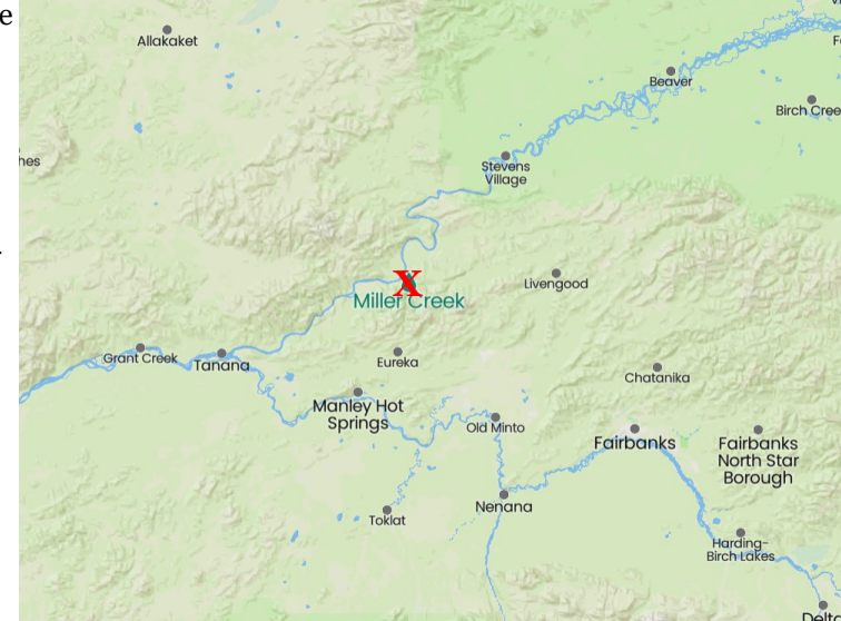
Miller Creek near Fairbanks Alaska

I am going to make a little stake but the chances are 2 to 1 the wrong way.