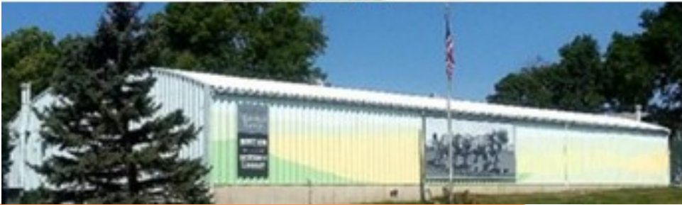
GEORGE WASHINGTON CARVER BUILDING